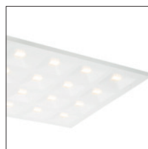
Quadro with multipower driver and LILO box