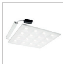
Quadro with DALI driver